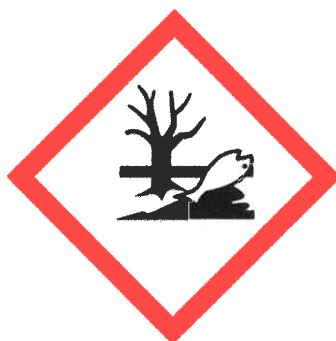
Environmental Impact (not OSHA jurisdiction)

Because the product identifier is found on the label, the SDS, and our chemical inventory, the product identifier links these three sources of information, permitting cross-referencing. The product identifier used by the supplier may be a common or trade name, a chemical name, or a number. Employees are advised that label information can be verified by referring to the corresponding SDS.