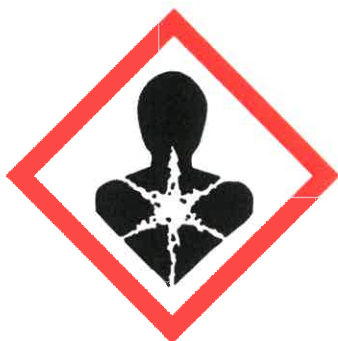
Chronic Health Hazard