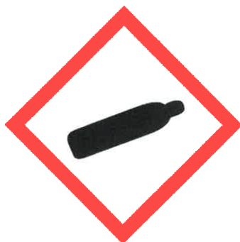
Gas Under Pressure